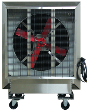
24" Variable Speed