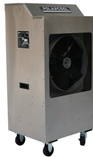
18" Variable Speed